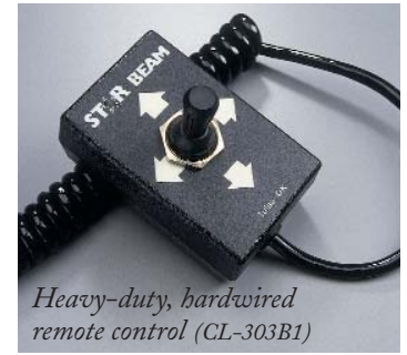
Heavy-duty, hardwired remote control (CL-303B1)