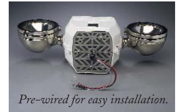
Pre-wired for easy installation.