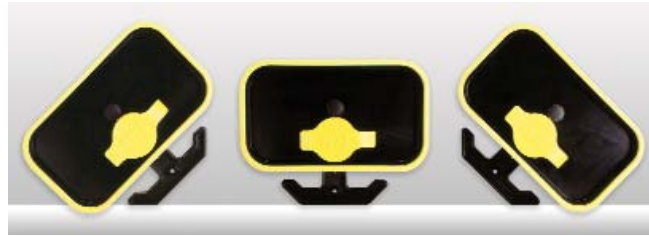
Flexible temporary mounting options including hanging (right), floor and angled (above).