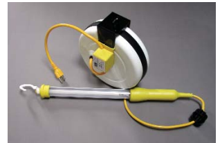
Fluorescent work light with pre-wired K&H Light-Duty Cord Reel